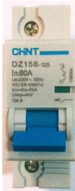
Images of DZ158-125